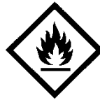
Commitment to Safety

At Cardinal Systems Integration, our leadership and staff focus on a commitment to customer service, quality control, and safety. Our clients can rest assured that their project needs will be met with uncompromised, professional solutions. Our service offerings position us to serve most, if not all needs with one customized package. Throughout the project timeline and long after commissioning, our results are backed by unparalleled customer support. Contact us to discuss your next project.