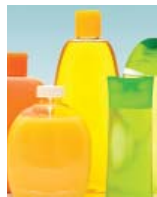
Consumer Packaged Goods