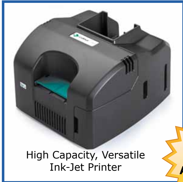
High Capacity, Versatile Ink-Jet Printer