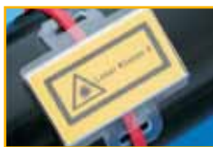
Labels for Cables