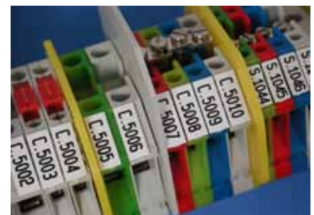
Easy to Read Printing