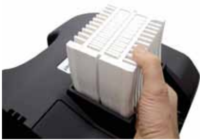
Cards fed automatically