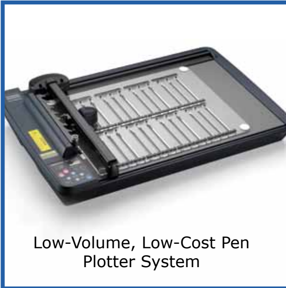
Low-Volume, Low-Cost Pen Plotter System

Print Systems for All Budgets, All Sizes of Projects and All Types of Labels