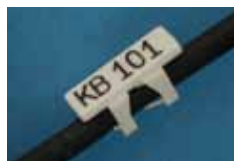
Direct apply saves time and money