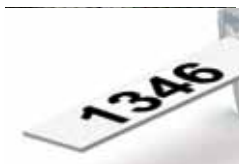
Easy to Read Printing eliminates mistakes