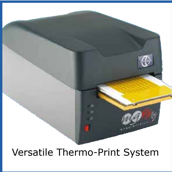
Versatile Thermo-Print System