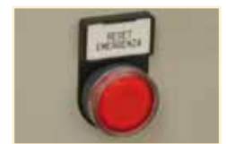
Switch and Pilot Light Labels