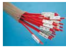
Less expensive than heat shrink or wrap around