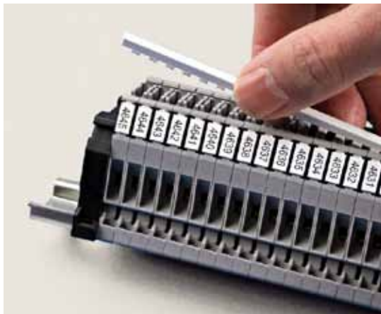
Strip or single apply markers