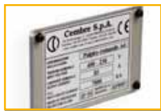
Panel ID Labels