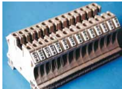
Labels for other Manufacturers