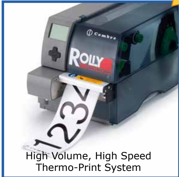
High Volume, High Speed Thermo-Print System