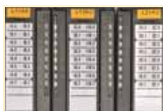
PLC I/O Labels