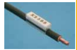
Protective Tube Style Ideal for Industrial Environments