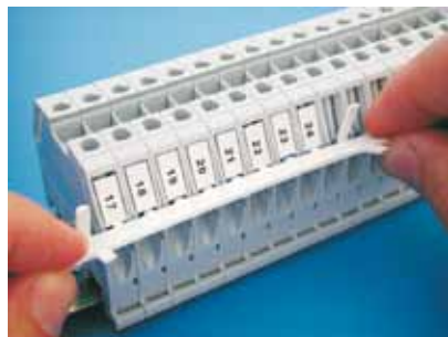
Install as a strip or single labels